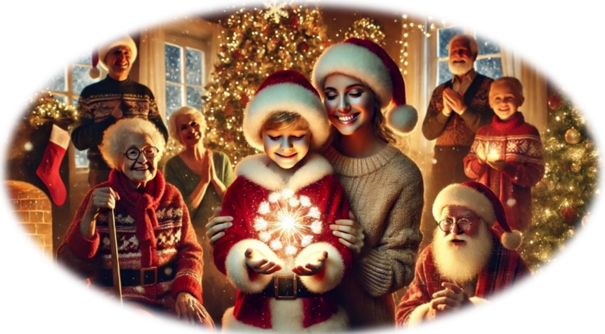
Figure 4 Singing Carols "We Wish You a Merry Christmas."