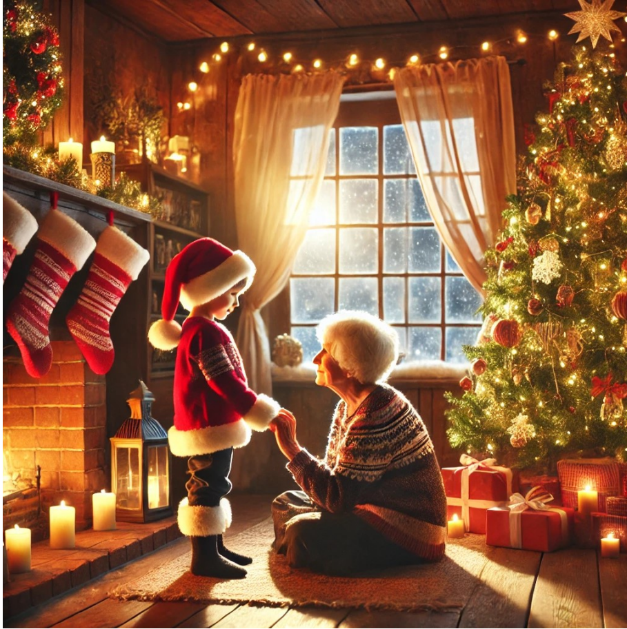
Figure 2 Cel with Grandma