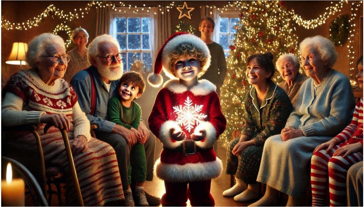
Figure 8 Cel at The Nursing Home