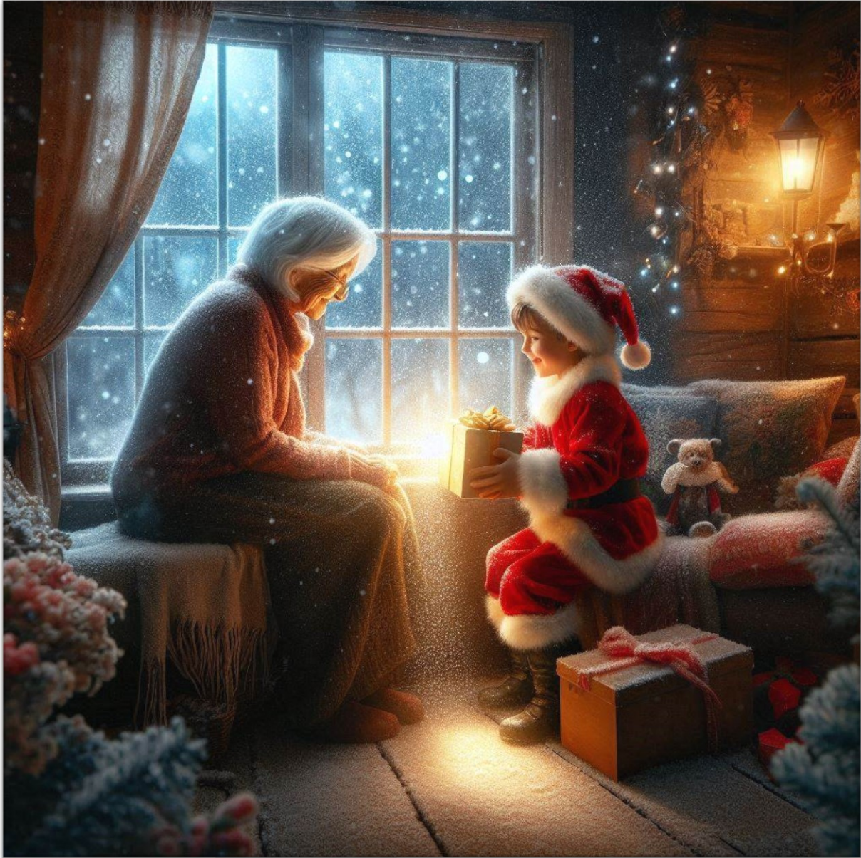
Figure 7 Cel at Mrs. Jenkins' Home

The magic didn't stop there. At Mrs. Jenkins' home, as they sang, something miraculous happened: her neglected garden bloomed again, with flowers reviving under the glow of the snowflake. "You are an angel," she said with tears in her eyes, gazing out the window at her garden.