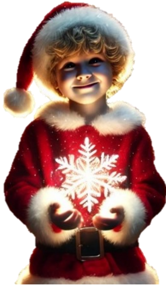
Figure 3 Shimmering Snowflake Landed on Cel