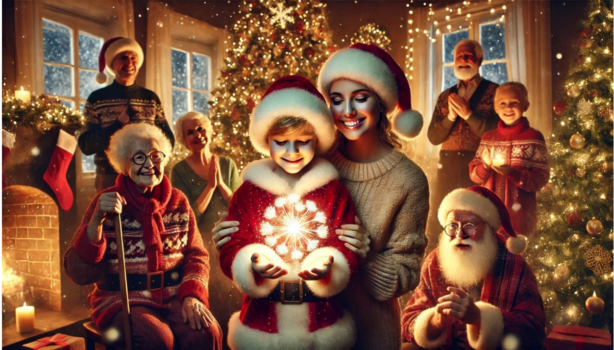
Figure 1 Cel With His Mom and Family