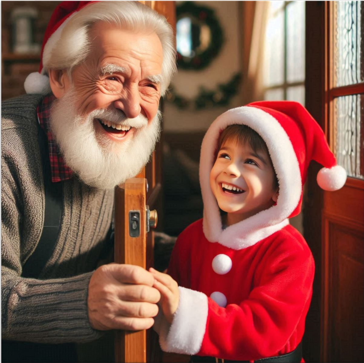
Figure 5 At Mr. Thompson's Home

A t Mr. Thompson's home, an elderly man who hadn't seen visitors in years, tears filled his eyes as he opened the door. "You've brought Christmas back to me, young man," he said, voice cracking with emotion. Cel handed him a small gift and hugged him, and the snowflake glowed even brighter.